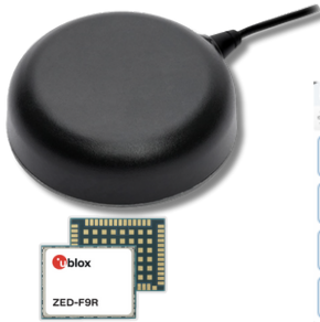
TP5794 Smart GNSS Antenna

The Calian TruPrecision SDK is a Windows application which provides an autonomous connection to stream Swift Navigation Skylark corrections to the TP5794 Smart Antenna . Additionally, a Virtual COM Port is provided to allow customers to connect to their existing applications within the Calian Smart GNSS Antenna high precision "corrected" position data output. The position data may be either NMEA or UBX formatted messages.