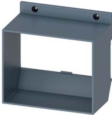
door feedthrough accessory for: 3VA12