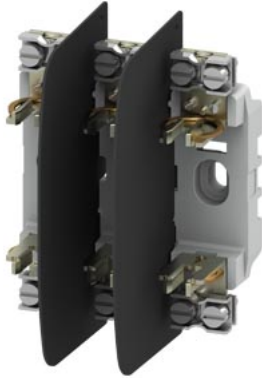
HRC fuse base plastic Sz. 00 3-pole 160A 690V clamp connection 6 x 70 mm 2