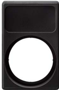
Label holder for labeling plate, Label size 9.5 x 18.5 mm,