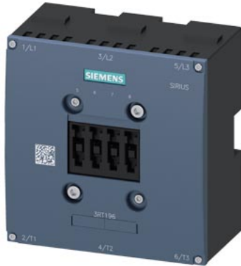
Arc chute for 3RT1056