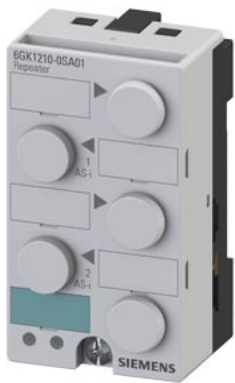
SIMATIC NET, Repeater for AS-Interface for cable extension in K45 enclosure