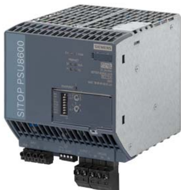
SITOP PSU8600/3AC/24VDC/40A PN

SITOP PSU8600 3AC 40 A PN stabilized power supply input: 400-500 V 3 AC output: 24 V DC/40 A with PN/IE connection web server integrated OPC UA server integrated