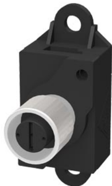
AS-Interface M12 branch U_ASI without Uaux, with M12 socket