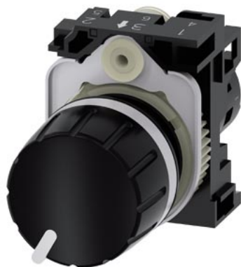
Potentiometer, compact, 22 mm, round, plastic, black, 10k ohm, with holder, screw terminal, with laser labeling, upper case