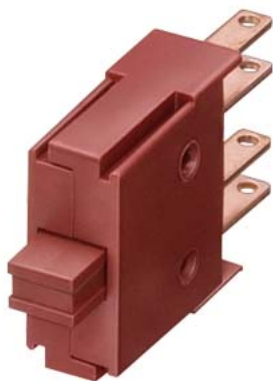
Contact block, 1 NO, with safety spring, flat connector terminal