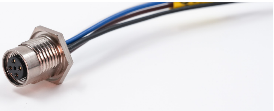
Back Mount Female Receptacle