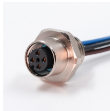
Panel Mount Female Receptacle