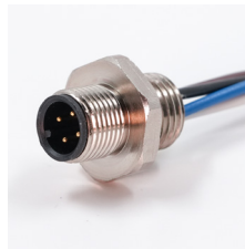
Panel Mount Male Receptacle