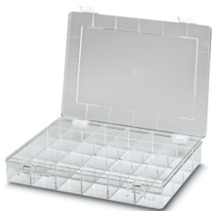
Assortment box, dimensions: 335 x 225 x 55 mm, 24 compartments, compartment size 1: 53 x 53 mm

Please be informed that the data shown in this PDF document is generated from our online catalog. Please find the complete data in the user documentation. Our general terms of use for downloads are valid.