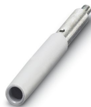
Test plug strip, number of positions: 1, color: gray

Please be informed that the data shown in this PDF document is generated from our online catalog. Please find the complete data in the user documentation. Our general terms of use for downloads are valid.