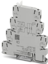
PLC solid-state relay with screw connection, for mounting on DIN rail NS 35/7.5, input: 24 V DC, output: TTL (5 V DC)

Please be informed that the data shown in this PDF document is generated from our online catalog. Please find the complete data in the user documentation. Our general terms of use for downloads are valid.