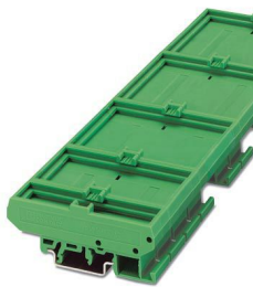
Electronic board base, plug-in module base element

Please be informed that the data shown in this PDF document is generated from our online catalog. Please find the complete data in the user documentation. Our general terms of use for downloads are valid.