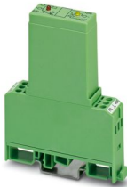
Power solid-state relay, with LED and protective circuit in input and output circuits, input: TTL 5 V DC, output: short-circuit-proof, 24 V DC/max. 2 A

Please be informed that the data shown in this PDF document is generated from our online catalog. Please find the complete data in the user documentation. Our general terms of use for downloads are valid.