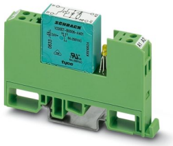
Relay module, with soldered-in miniature switching relay, contact (AgNi): Medium to large loads, 1 N/C contact, input voltage 24 V DC

Please be informed that the data shown in this PDF document is generated from our online catalog. Please find the complete data in the user documentation. Our general terms of use for downloads are valid.