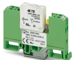
Relay module, with soldered-in miniature switching relay, contacts (AgNi): Medium to large loads, 1 N/O contact, input voltage 60 V DC

Please be informed that the data shown in this PDF document is generated from our online catalog. Please find the complete data in the user documentation. Our general terms of use for downloads are valid.