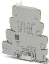
PLC-INTERFACE for TTL signal, consisting of PLC-O.../TTL basic terminal block with push-in connection and integrated solid-state relay, for mounting on DIN rail NS 35/7,5, 1 N/O contact, input: 24 V DC, output: TTL (5 V DC)

Please be informed that the data shown in this PDF document is generated from our online catalog. Please find the complete data in the user documentation. Our general terms of use for downloads are valid.