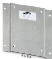
Mounting plate for SFNT switches

Please be informed that the data shown in this PDF document is generated from our online catalog. Please find the complete data in the user documentation. Our general terms of use for downloads are valid.