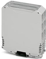
DIN rail housing, Complete housing with metal foot catch, tall design, with vents, width: 35.2 mm, height: 99 mm, depth: 113.65 mm, color: light gray (similar RAL 7035), cross connection: DIN rail bus connector (optional), number of positions cross connector: 5

Please be informed that the data shown in this PDF document is generated from our online catalog. Please find the complete data in the user documentation. Our general terms of use for downloads are valid.