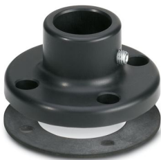
Foot for tube Ø 25 mm, aluminium, black

Please be informed that the data shown in this PDF document is generated from our online catalog. Please find the complete data in the user documentation. Our general terms of use for downloads are valid.