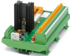
16-channel digital input module with screw connection and integrated knife disconnect function. Redundant voltage supply. Suitable for Yokogawa SDV 144 card.

Please be informed that the data shown in this PDF document is generated from our online catalog. Please find the complete data in the user documentation. Our general terms of use for downloads are valid.