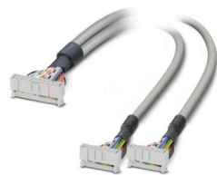
Round cable set; connection 1: IDC/FLK socket strip (1x 20-position); connection 2: IDC/FLK socket strip (2x 14-position); cable length: 1 m

Please be informed that the data shown in this PDF document is generated from our online catalog. Please find the complete data in the user documentation. Our general terms of use for downloads are valid.