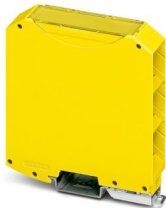
DIN rail housing, Complete housing with metal foot catch, flat design, without vents, width: 22.6 mm, height: 85 mm, depth: 91.15 mm, color: yellow (similar RAL 1018), cross connection: DIN rail bus connector (optional), number of positions cross connector: 5

Please be informed that the data shown in this PDF document is generated from our online catalog. Please find the complete data in the user documentation. Our general terms of use for downloads are valid.