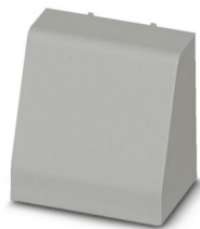
DIN rail housing, Filler plug for unoccupied terminal points (tall design), width: 21.35 mm, height: 19.65 mm, depth: 13.67 mm, color: light gray (similar RAL 7035)

Please be informed that the data shown in this PDF document is generated from our online catalog. Please find the complete data in the user documentation. Our general terms of use for downloads are valid.