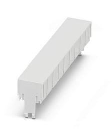
DIN rail housing, 9U, Housing cover, width: 18.9 mm, height: 98.8 mm, depth: 26 mm, color: light gray (similar RAL 7035)

Please be informed that the data shown in this PDF document is generated from our online catalog. Please find the complete data in the user documentation. Our general terms of use for downloads are valid.