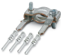
Shield connection for one shielded cable on male contact carriers, without loose crimp contacts

Please be informed that the data shown in this PDF document is generated from our online catalog. Please find the complete data in the user documentation. Our general terms of use for downloads are valid.