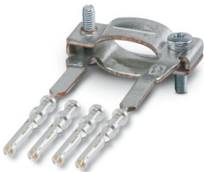
Shield connection for two shielded cables on female contact carriers, without loose crimp contacts

Please be informed that the data shown in this PDF document is generated from our online catalog. Please find the complete data in the user documentation. Our general terms of use for downloads are valid.