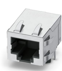
Filtered RJ45 PCB connectors, 1x1 single-port, connection direction of the connector to the PCB: 90 °, Tab down, Shielded, shield springs, number of positions: 8, 10/100 Mbps, THT, Wave, type of packaging: Tray

Please be informed that the data shown in this PDF document is generated from our online catalog. Please find the complete data in the user documentation. Our general terms of use for downloads are valid.