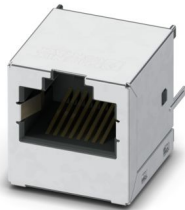
Filtered RJ45 PCB connectors, connection direction of the connector to the PCB: 180 °, number of positions: 8, 1 Gbps, THT, Wave, type of packaging: Tray

Please be informed that the data shown in this PDF document is generated from our online catalog. Please find the complete data in the user documentation. Our general terms of use for downloads are valid.