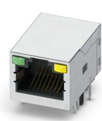
Filtered RJ45 PCB connectors, 1x1 single-port, connection direction of the connector to the PCB: 90 °, Tab up, Shielded, LED (green, yellow), number of positions: 8, 1 Gbps, THT, Wave, type of packaging: Tray

Please be informed that the data shown in this PDF document is generated from our online catalog. Please find the complete data in the user documentation. Our general terms of use for downloads are valid.