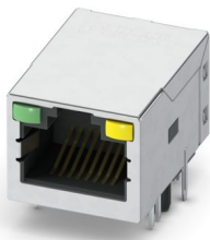
Filtered RJ45 PCB connectors, connection direction of the connector to the PCB: 90 °, Tab up, number of positions: 8, 1 Gbps, THT, Wave, type of packaging: Tray

Please be informed that the data shown in this PDF document is generated from our online catalog. Please find the complete data in the user documentation. Our general terms of use for downloads are valid.