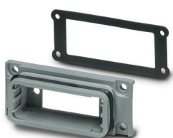
D-SUB panel mounting frame, shell size 1, IP67 degree of protection, black

Please be informed that the data shown in this PDF document is generated from our online catalog. Please find the complete data in the user documentation. Our general terms of use for downloads are valid.