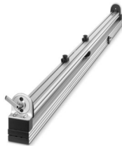
Ergonomic device for mounting terminal strips

Please be informed that the data shown in this PDF document is generated from our online catalog. Please find the complete data in the user documentation. Our general terms of use for downloads are valid.