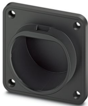
CHARX connect, GB/T, Charging connector holder, Accessories, Front mounting, housing: black, for vehicle charging connectors on charging stations (EVSE), GB/T 20234.2

Please be informed that the data shown in this PDF document is generated from our online catalog. Please find the complete data in the user documentation. Our general terms of use for downloads are valid.