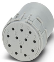
Contact insert, M23, number of positions: 12, contact connection type: Socket, Crimp connection, series: NC, RC, RM, TU, UC

Please be informed that the data shown in this PDF document is generated from our online catalog. Please find the complete data in the user documentation. Our general terms of use for downloads are valid.