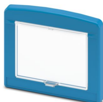
Housing frame, Hinged cover (transparent), color: blue (similar RAL 5015)

Please be informed that the data shown in this PDF document is generated from our online catalog. Please find the complete data in the user documentation. Our general terms of use for downloads are valid.