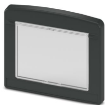
Housing frame, Latching cover (non-detachable), color: black (similar RAL 9005)

Please be informed that the data shown in this PDF document is generated from our online catalog. Please find the complete data in the user documentation. Our general terms of use for downloads are valid.