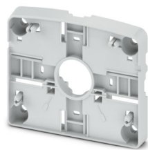
Adapter plate, color: light gray (similar RAL 7035), dimensions: 116.9 x 94.41 x 20.2 mm

Please be informed that the data shown in this PDF document is generated from our online catalog. Please find the complete data in the user documentation. Our general terms of use for downloads are valid.