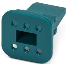
Terminal position assurance, number of positions: 6, material: PA-GF

Please be informed that the data shown in this PDF document is generated from our online catalog. Please find the complete data in the user documentation. Our general terms of use for downloads are valid.