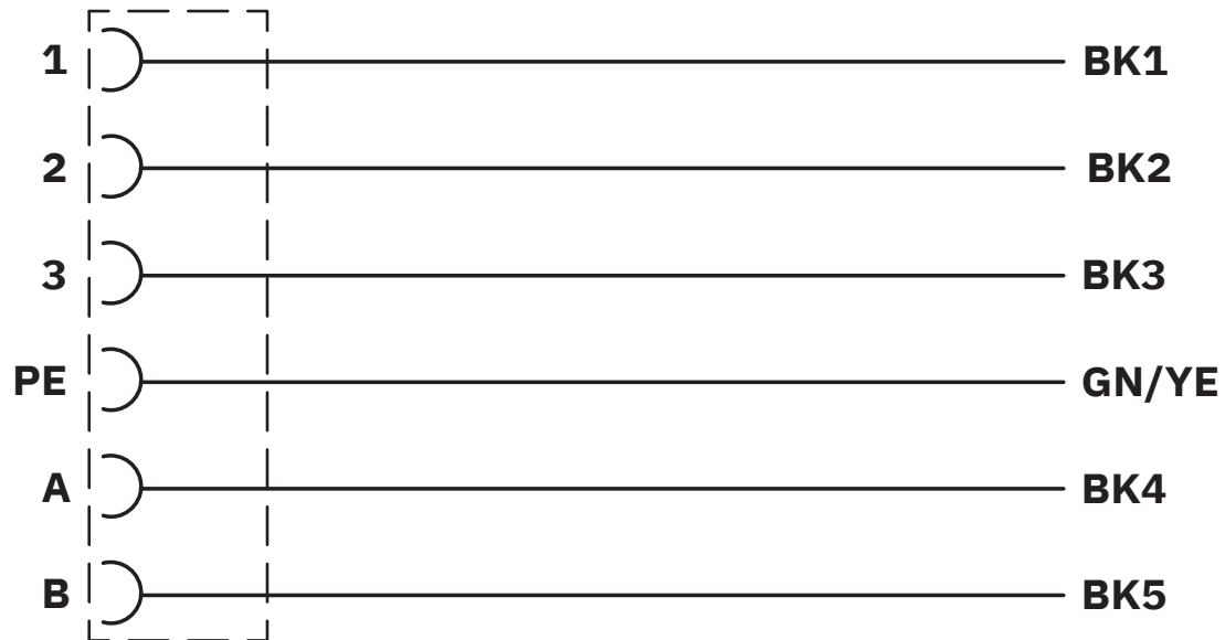
Contact assignment of the S15 female connector