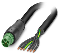
Power cable, 6-position, PUR halogen-free, black, Plug straight Size 15 Bayonet locking, on free cable end, cable length: 3 m, For alternating current up to 16 A/600 V

Please be informed that the data shown in this PDF document is generated from our online catalog. Please find the complete data in the user documentation. Our general terms of use for downloads are valid.