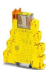
Safe coupling relay with force-guided contacts, electrically isolated, 2 changeover contacts, 1-channel, fixed screw terminal block, width: 14 mm

Please be informed that the data shown in this PDF document is generated from our online catalog. Please find the complete data in the user documentation. Our general terms of use for downloads are valid.