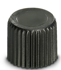
M12 sealing cap for unoccupied M12 plugs of the sensor/actuator cable, flush-type plugs and I/O devices in the field

Please be informed that the data shown in this PDF document is generated from our online catalog. Please find the complete data in the user documentation. Our general terms of use for downloads are valid.