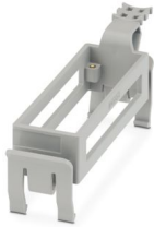
DIN rail mounting frame, design: B24, for contact inserts, Top frame

Please be informed that the data shown in this PDF document is generated from our online catalog. Please find the complete data in the user documentation. Our general terms of use for downloads are valid.