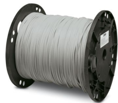
By the meter, Cable reel, PUR halogen-free, gray RAL 7001, 3-wire, color single wire: brown, blue, black, cable length: 100 m, highly flexible, resistant to welding sparks

Please be informed that the data shown in this PDF document is generated from our online catalog. Please find the complete data in the user documentation. Our general terms of use for downloads are valid.