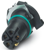
Contact carrier, Power, 5-position, Socket, straight, M12, L-coding, THR solder connection

Please be informed that the data shown in this PDF document is generated from our online catalog. Please find the complete data in the user documentation. Our general terms of use for downloads are valid.