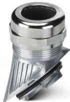
EVO metal cable gland with bayonet locking; size M40, for 5 conductors with 8.5 mm cable diameter

Please be informed that the data shown in this PDF document is generated from our online catalog. Please find the complete data in the user documentation. Our general terms of use for downloads are valid.