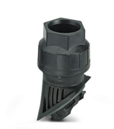
EVO plastic cable gland with bayonet locking; size M40, for 4 conductors with 10 mm cable diameter

Please be informed that the data shown in this PDF document is generated from our online catalog. Please find the complete data in the user documentation. Our general terms of use for downloads are valid.